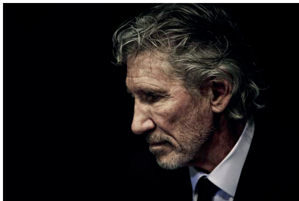
JUST ANOTHER BRICK... Pink Floyd co-founder Roger Waters. -----

Today, thousands of artists across the world refuse to perform in Israel, including a host of global superstars such as Roger Waters from Pink Floyd (below), Lauryn Hill, Chuck D, Talib Kweli, John Berger, Arundhati Roy, Iain Banks, Judith Butler, Naomi Klein, Ken Loach, Angela Davis, Mira Nair, Mike Leigh and many others.