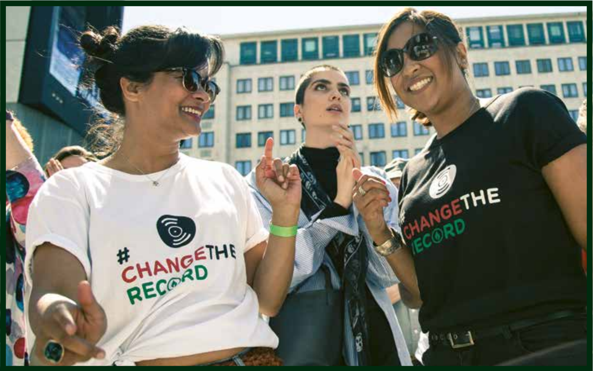
ABOVE: CHANGE THE RECORD launch event — South Bank, London. Saturday 10th June 2017