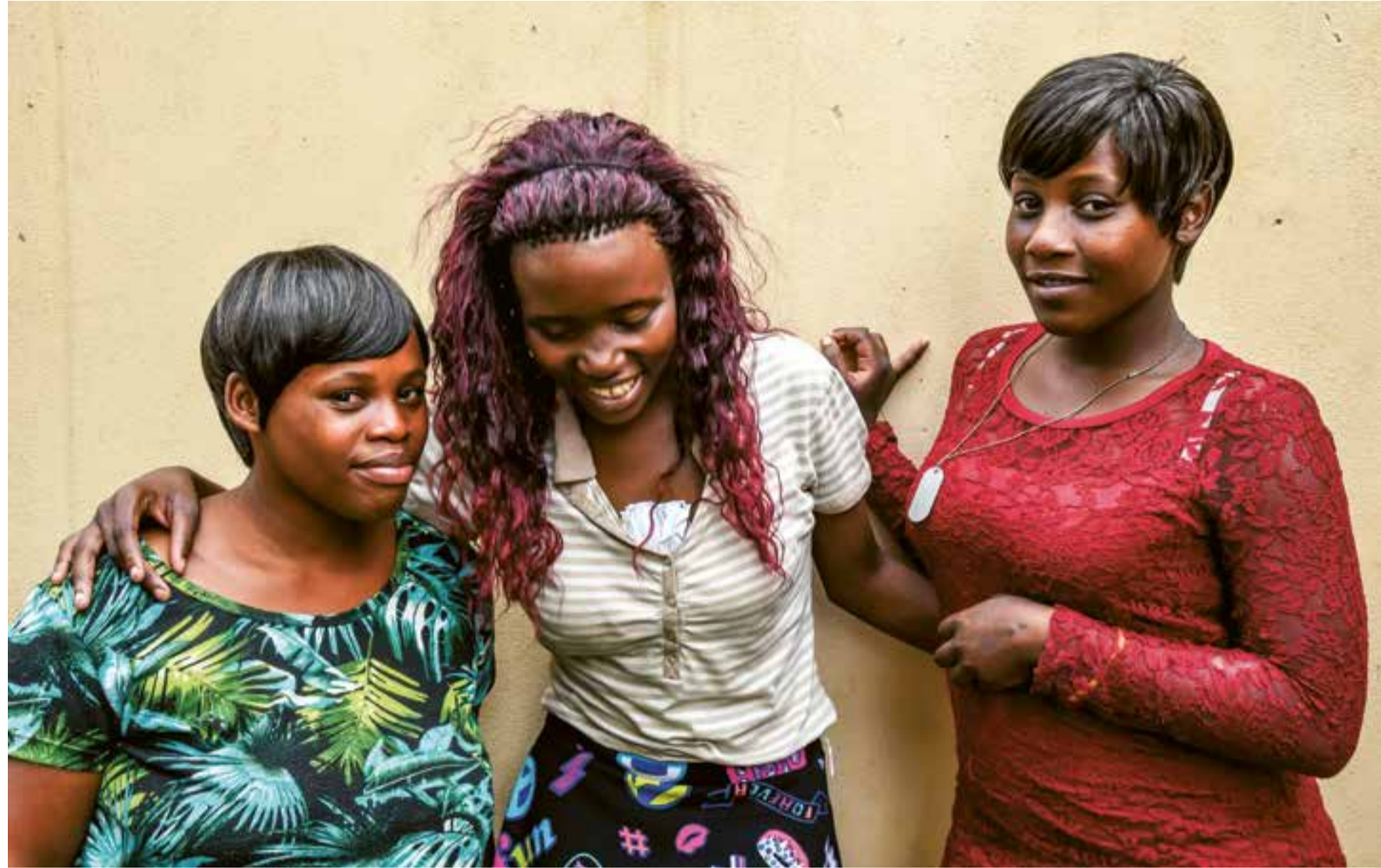
UMTHOMBO — DURBAN, SOUTH AFRICA Three young women enjoying each other's company at the end of a drop-in session at Umthombo's centre.