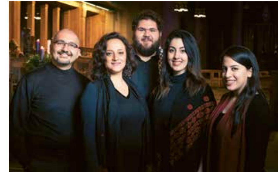
ABOVE SUBLIME — it was the Choir of Bethlehem's first visit to the UK. They were so well received everywhere we went and were such fun.