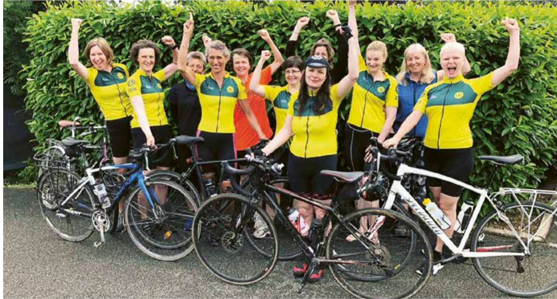
Members of AMOS ROAD CLUB on the London to Paris ride in May 2018. Join them in the Peak District this year.