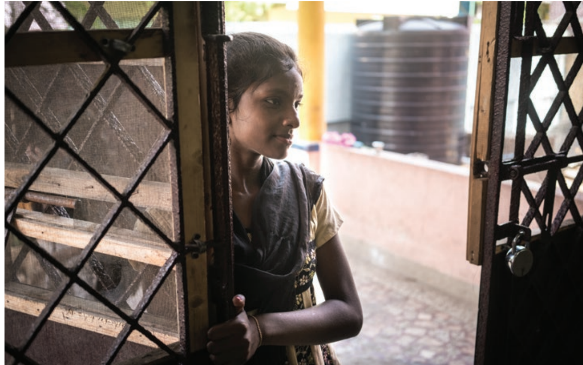
ABOVE At the Karunalaya girl's centre, young women can access in-depth psychosocial support to address trauma they experience on the streets.