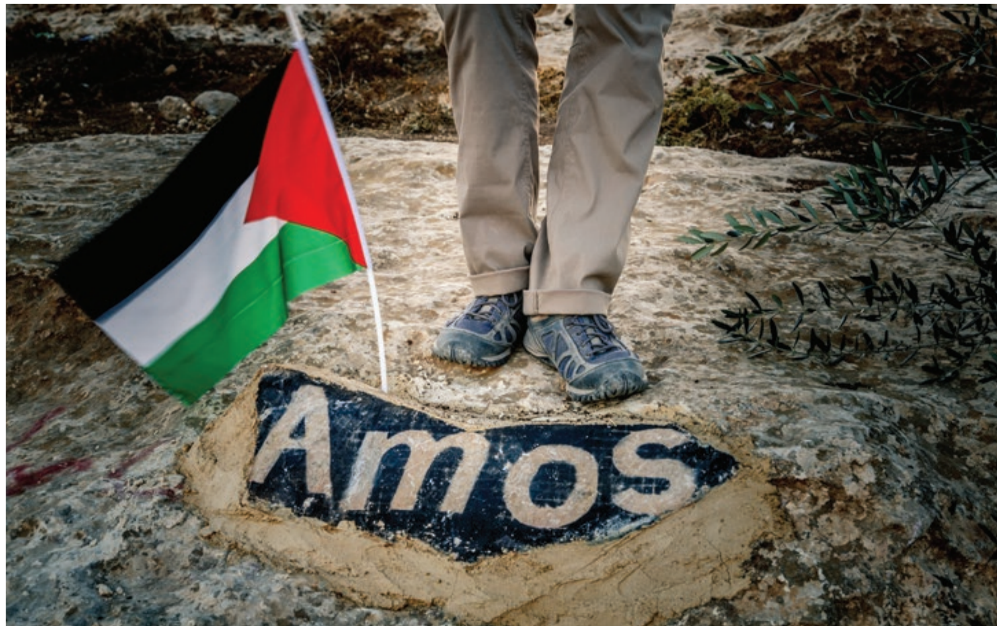
LEFT STANDING IN SOLIDARITY At the Sumud Peace Camp in the South Hebron Hills where we were honoured with our very own rock during Just Walk.