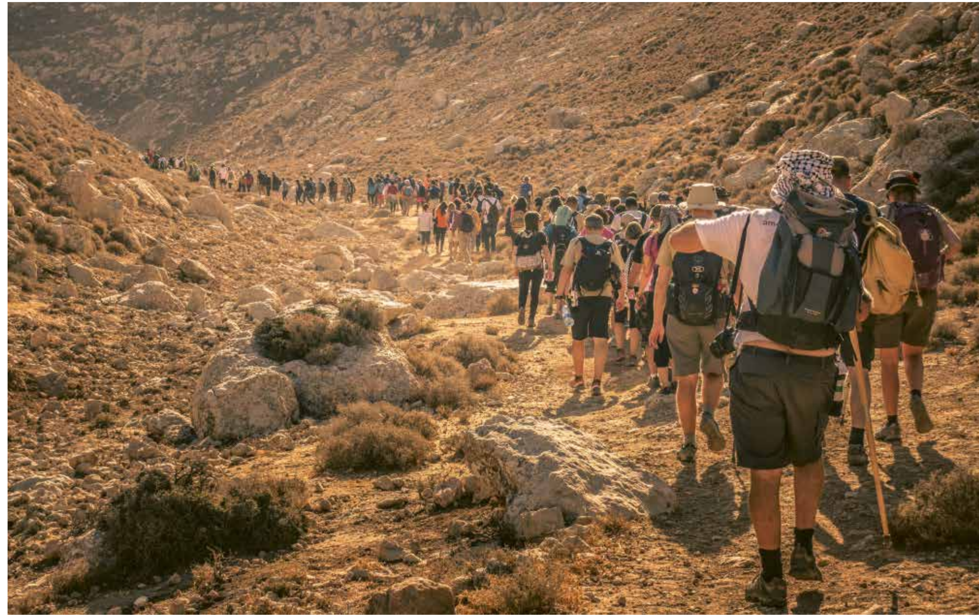
ABOVE Over 160 people snake their way through the Judeaan Wilderness in the West Bank on Just Walk to Jerusalem — 27th October 2017