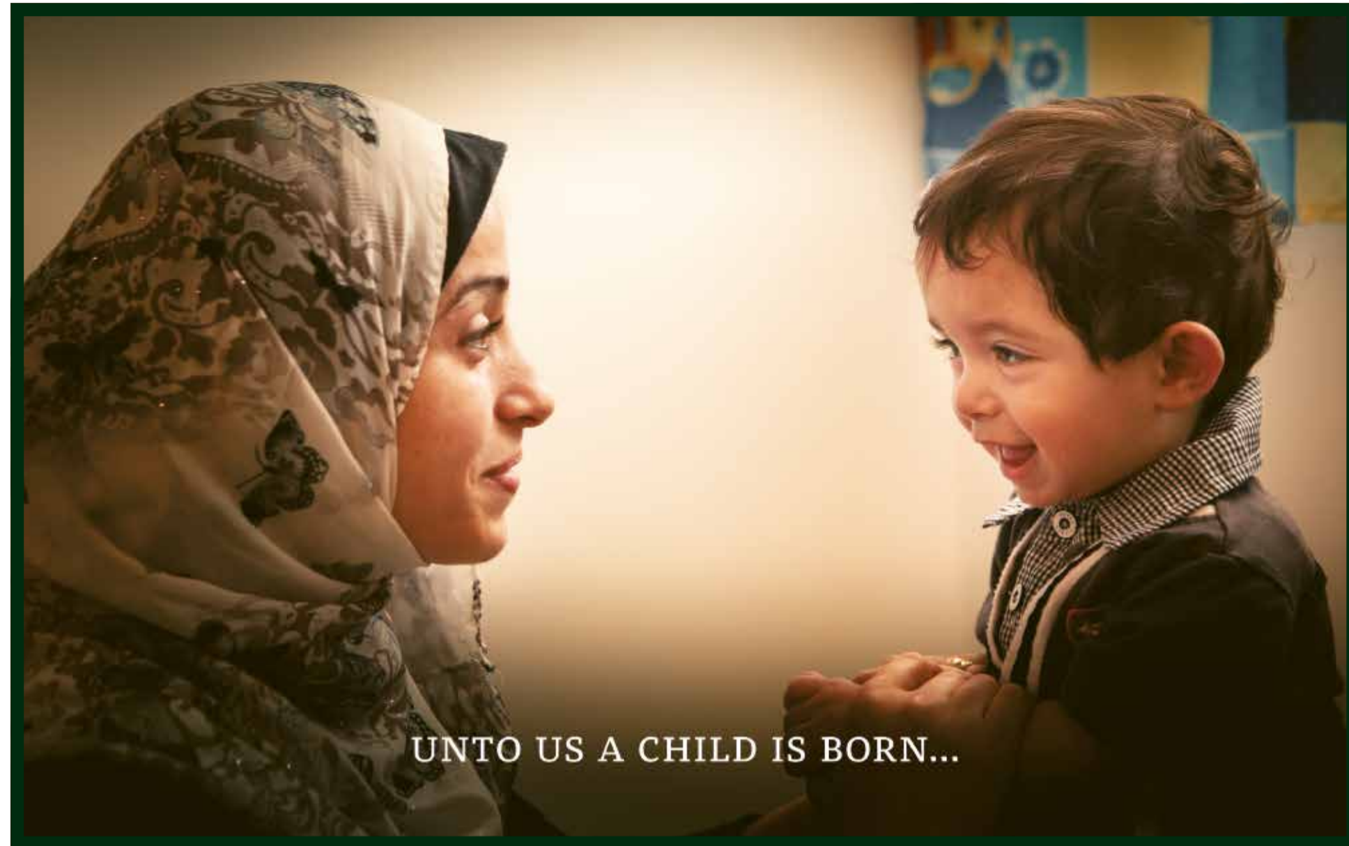
ABOVE: UNTO US A CHILD IS BORN — new Amos Trust Christmas cards for 2017