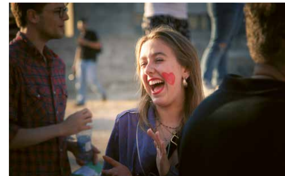
LEFT The annual Bet Lahem Live Festival grew from a conversation between Sami, ourselves and our friends at Greenbelt Arts Festival. Now it's a creative mix of art, faith and justice that spills out onto the streets of Bethlehem.

To watch our short film about Holy Land Trust, please visit vimeo.com/amostrust/holylandtrust